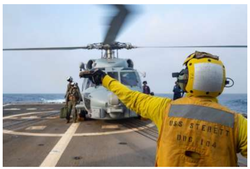
Conducting OPS with the Nimitz Strike Group

Even though we are isolated from the rest of the world, we continue to practice what we can to prevent the inadvertent spread of COVID. So you'll see masks on faces on some of our social media posts. But even a global pandemic cannot stop our screws from turning. We have conducted over 50 damage control, medical, combat systems, and intel collection trainings in total since the beginning of deployment to make sure we are prepared for any situation. Our MWR program has put on numerous events, including video game tournaments, bingo nights, and movie nights, to help the crew relax after a long day's work. There are few days onboard more exciting than receiving packages of mail from friends and family after a successful replenishment-at-sea.