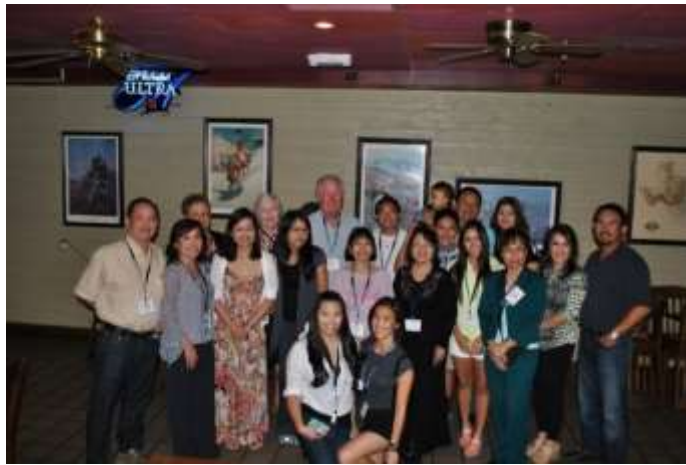
Sterett Reunion – 2017, Nashville, TN