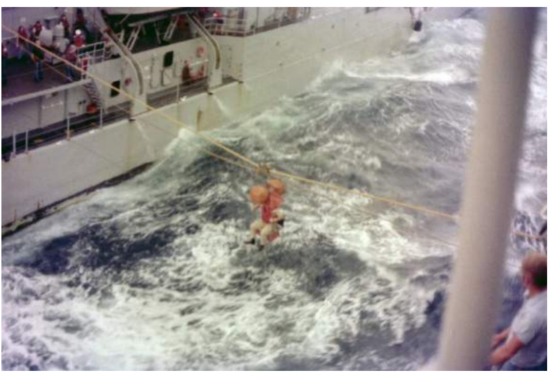
Hi Line Transfer